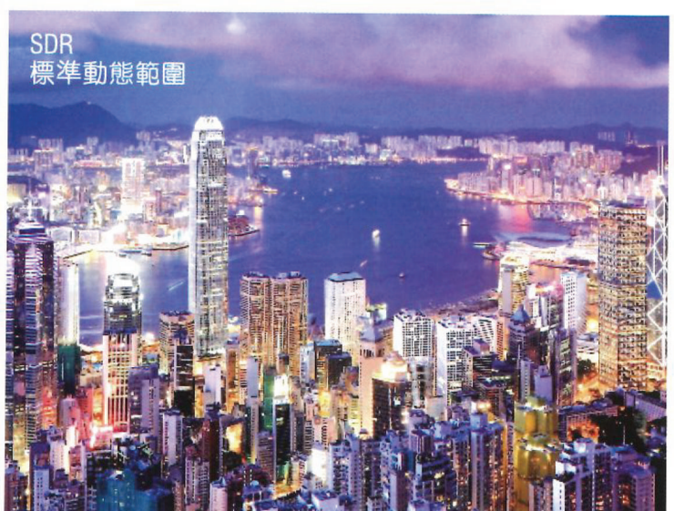
The technology of TFI has enhanced the video quality as shown on the left screen while the screen on the right shows the original video quality. 如左方影像所示，天開的技術令影像質素得到多方位提升。右方為原版影像。