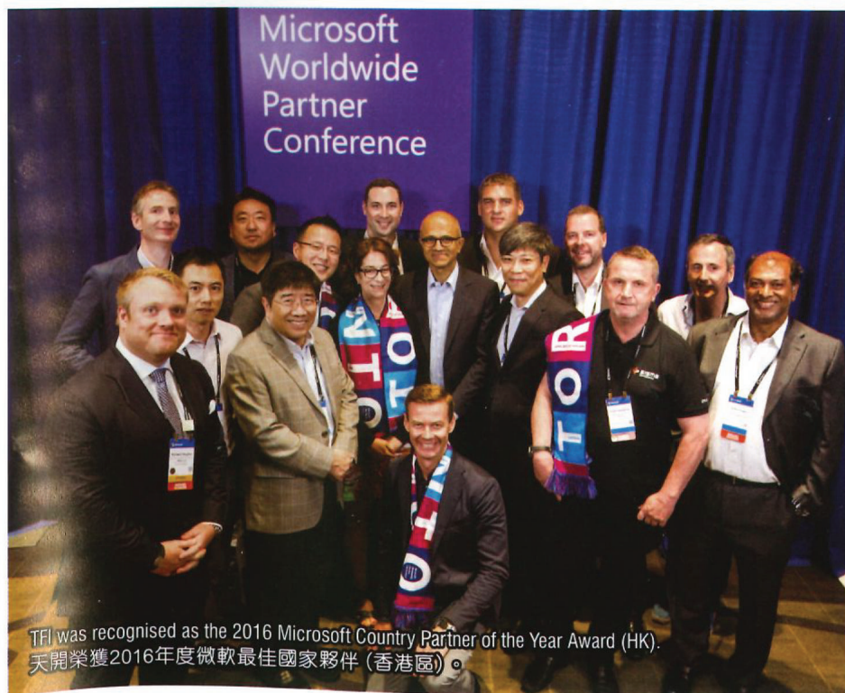
TFI was recognised as the 2016 Microsoft Country Partner of the Year Award (HK). 天開榮獲2016年度微軟最佳國家夥伴（香港區）。